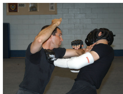
Rigorous, physical training is a fundamental aspect of the external styles of Kung Fu.

The monks of the new Buddhist and Taoist religions were instrumental in the development of Kung Fu, as well as the eventual adoption of many spiritual aspects within the Art. During the Sixth century A.D (the century before the T'ang period, when several monks became legendary for their Martial Arts prowess), one of the most fundamental figures in Kung Fu history purportedly arrived in China,