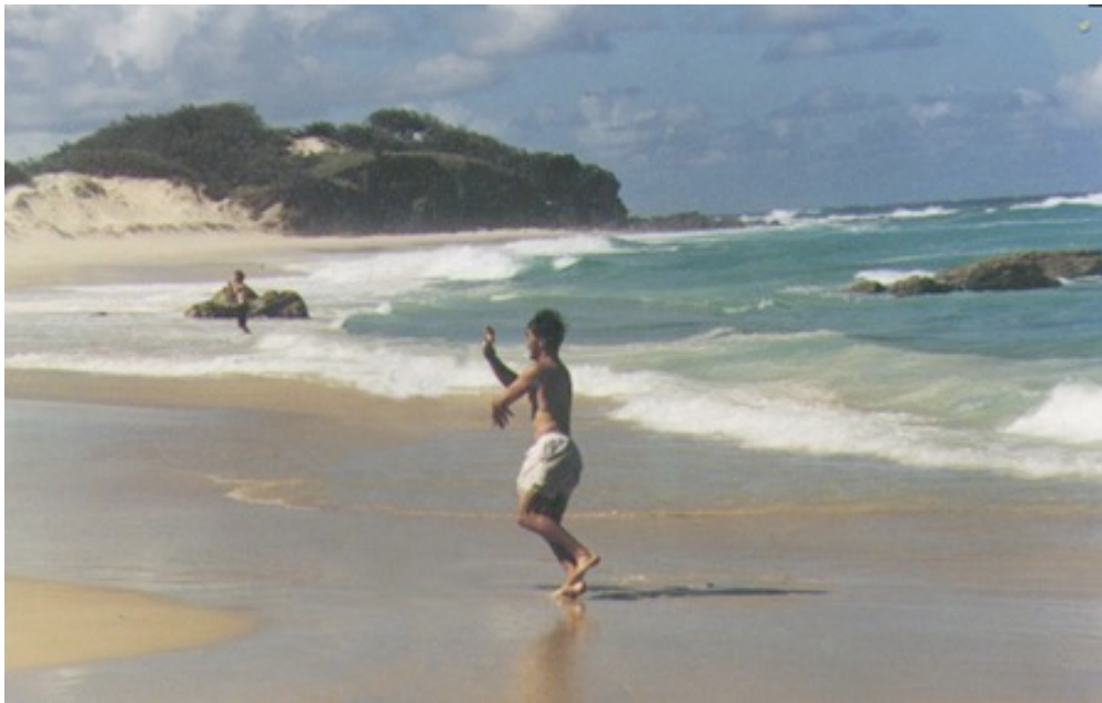
Kung Fu Club Members practising a drill at the Stradbroke Island Camp!

At times, we have even held camping trips and workshops at Stradbroke Island.